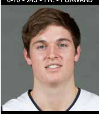
MEQUON, WIS. HOMESTEAD HS