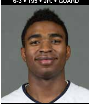
LAS VEGAS, NEV. BISHOP GORMAN