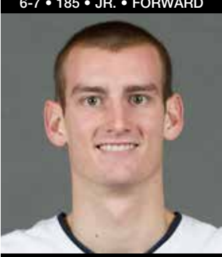
HIGHLAND, UTAH UTAH