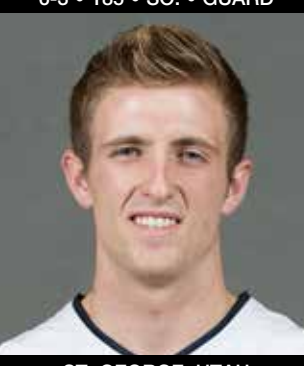
ST. GEORGE, UTAH SNOW CANYON HS