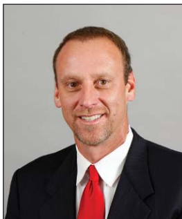
LARRY KRYSKOWIAK Head Coach 3rd Season