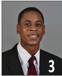
3 PRINCETON ONWAS G/F Fr. 6-5 202 Houston, Texas