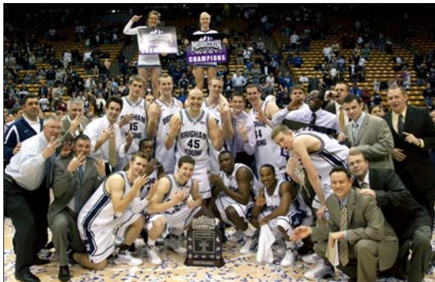
BYU clinched its third-straight Mountain West Conference title with a win at home against Air Force in the regular season finale.

BYU opened the postseason with an 80-69 win over Air Force in the first round of the MWC tournament to give the Cougars their 10th win in 11 games. In the semifinals BYU failed to advance to a third-straight conference tournament title game, falling short against San Diego State. Two days later the Cougars learned they had received the program's 24th berth to the NCAA tournament. For the second-straight season BYU faced Texas A&M as the No. 8 seed, this time in Philadelphia. Unfortunately for the Cougars the outcome was the same as 2008 as the Aggies eliminated BYU 79-66 in the first round.