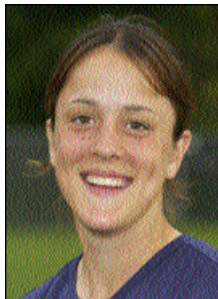
This is the in BYU history that a player has been named to the Soccer America Team of the Week.