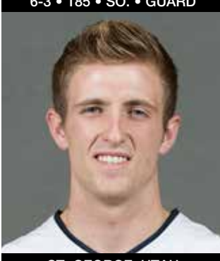
ST. GEORGE, UTAH SNOW CANYON HS