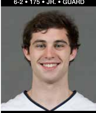
ARCADIA, ARIZONA BLOOMINGTON SOUTH HS