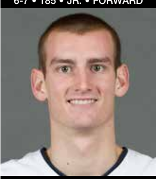
HIGHLAND, UTAH UTAH