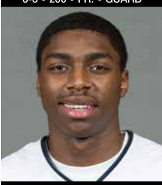
BATON ROUGE, LA. FUTURE COLLEGE PREP