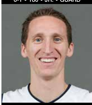
OREM, UTAH SALT LAKE CC