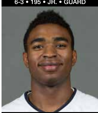
LAS VEGAS, NEV. BISHOP GORMAN