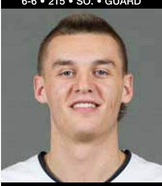
PROVO, UTAH PROVO HS